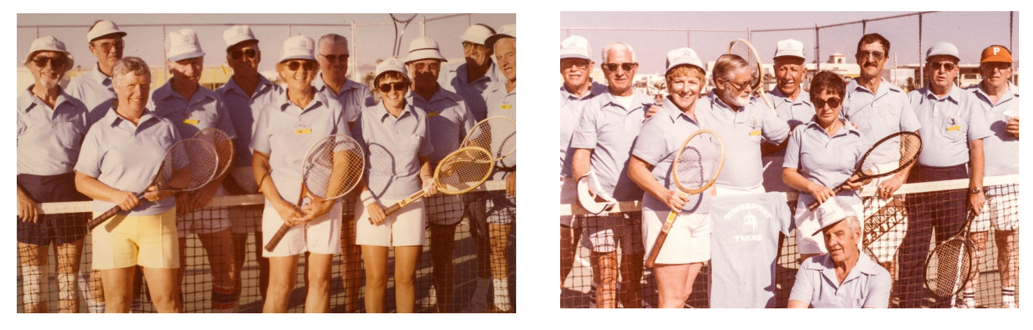
A - Team

In the beginning the Tennis Club had only 12 players, men and women combined. Just enough to fill two courts from 7am to 6pm every day. Mixed doubles was the norm. The park continued to attracted tennis players. Soon a 3rd court was added.