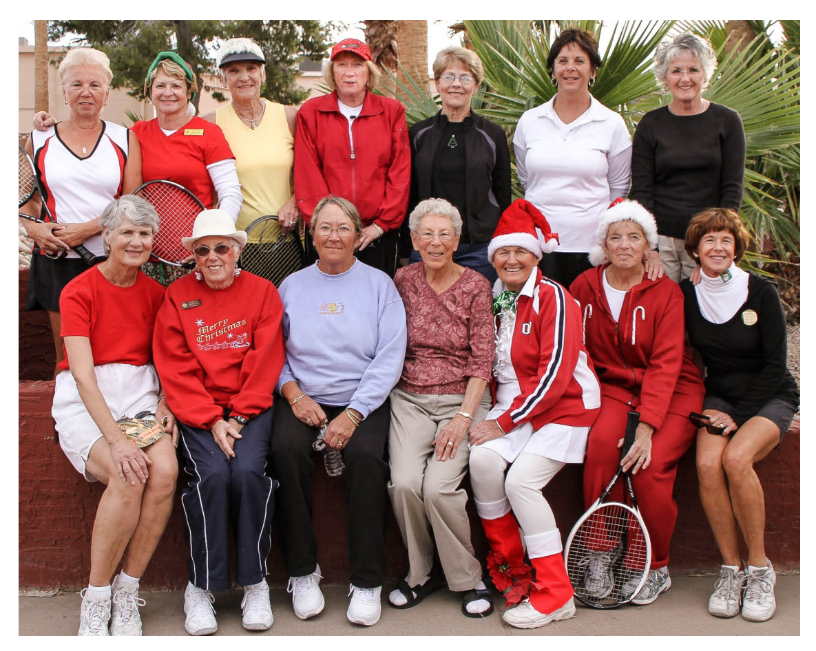
2009 December Tennis Fun Day